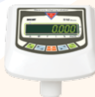
Ti10 Weighing Indicator