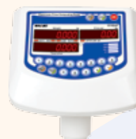
Ti10-P Price Computing