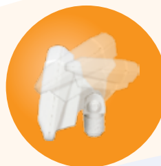
TILTABLE HEAD 90°