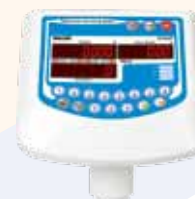
Ti10-C Counting Indicator