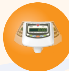
SWIVEL HEAD 360°