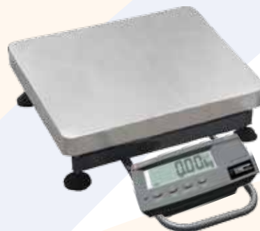
BENCH SCALE CONFIGURATION