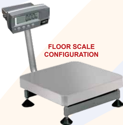
FLOOR SCALE CONFIGURATION